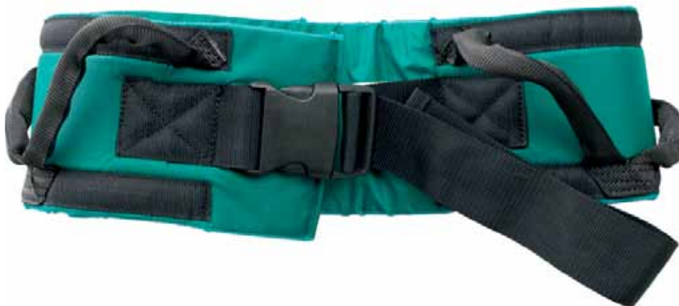
Etac SupportBelt has diagonally placed handles that allows the caregiver to maintain a more ergonomic grip.

SupportBelt is a useful tool when helping a person to stand up or sit down, to support walking or to assist during transfer between bed, wheelchair, chair, etc. SupportBelt has non-slip material on the inside and an adjustable belt buckle.